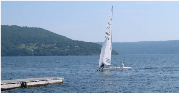
A Star returns to the dock after the races on August 24 th