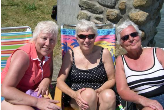
Enjoying the lake in 2007