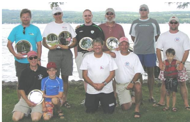
MC Sailability after the Nor'Eastern Championship